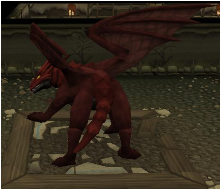
Not a happy chappy (Caption of the day ☺.)

He'll tell you to grab supplies from his bag.